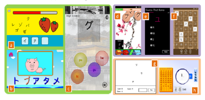
Fig. 1. Related games: green area for Android, purple area for Windows Phone and orange area for Web.

And Learn Japanese Katakana! <sup>3</sup> (Makorino), which is similar to the first game presented; this game presents katakana characters with sound, and then brings pictures of animals with spread characters for the player to form the word; it also has a very childish interface, and, as the first, is more suitable for Japanese students, not foreign. Fig. 1, green area, shows screenshots of (a) Katakana Colocar Lite, (b) Learn Japanese Katakana! and (c) Kana Pop.