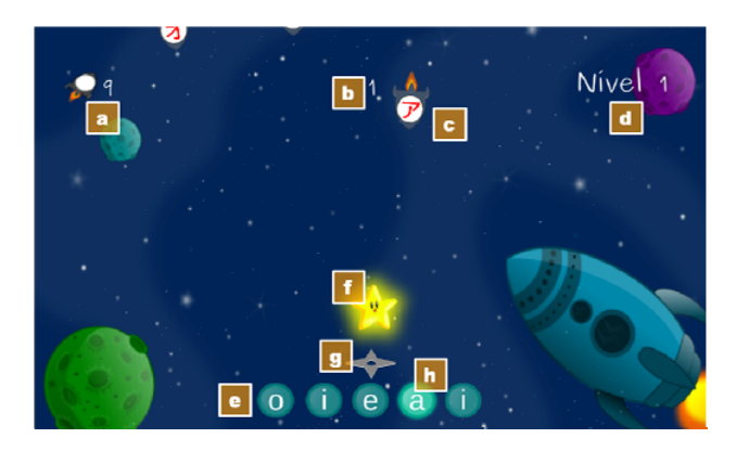
Fig. 4. Katakana Star Samurai level screen: (a) enemies left (b) score (c) enemy (d) level (e) buttons area (f) star (g) shooter in the shape of a shuriken (h) a selected button.

The gameplay is simple, as shown in Fig. 4. At the top, Fig. 4a shows the number of enemies left to destroy in the current level, Fig. 4b shows the current score, Fig 4c shown an enemy that comes from above of off screen heading to the star, and Fig. 4d shows the current level. In the bottom of the screen there are the shot buttons (Fig. 4e) and the shuriken gun (Fig. 4g). Fig 4h shows a selected button. Right above, (Fig. 4f) is the star to be protected. Each shot button contains hiragana or roma-ji characters (according to mode choice) - corresponding to the katakana carried by the enemies, or some other characters to puzzle the choice of the button. The player has to touch the button, and following, touch the enemy with the katakana that matches the hiragana or roma-ji touched, destroying the evil ship. If an evil ship is not destroyed it reaches the star and steals some of its energy, and if the star loses all its energy, it dies and the level is failed.