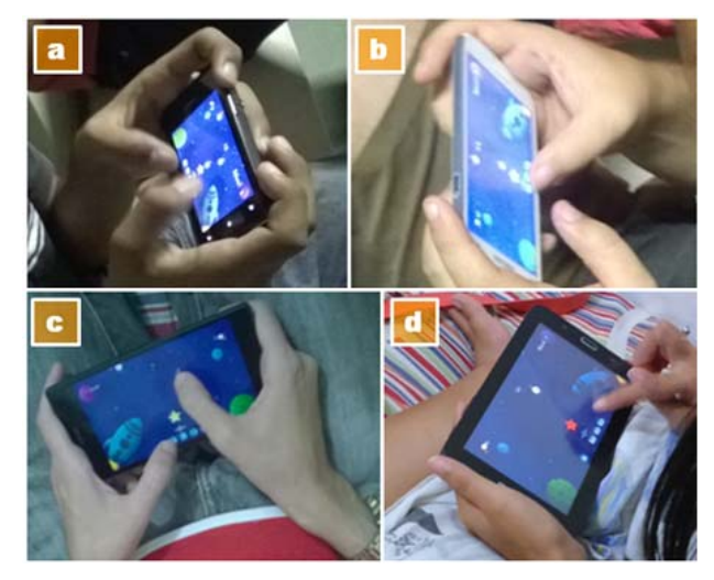
Fig. 2. Design on different screen sizes: (a) 3.5'' (b) 5'' (c) 6'' (d) 7''.

Fig. 3 presents other screens of Katakana Star Samurai, as home screen (Fig. 3a), mode choice screen (Fig. 3b), level choice screen (Fig. 3c) and a gameplay of level 1 with star dying (Fig. 3d).