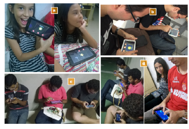
Fig. 8. Users playing Katakana Star Samurai.

There were accomplished three sessions of experience: the first with two advanced students; the second with one intermediate student and two users with no knowledge of katakana; and the third with a beginner and two with no knowledge. Fig. 8 shows some moments of the users playing Katakana Star Samurai. In Fig. 8a two different moments of the same user are shown: succeeding and failing in a level. Fig. 8b shows two users playing simultaneously, with the same screen size, Fig. 8c and Fig. 8d show users playing with different screen sizes.